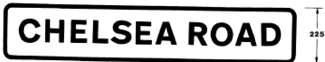
FIG. VII TRANSPORT HEAVY ( \frac{1}{3.2} ) - 105 (related to 75 x-height)