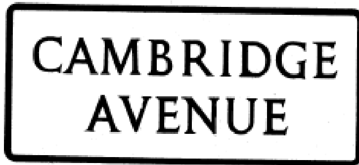
FIG. I KINDERSLEY - 90