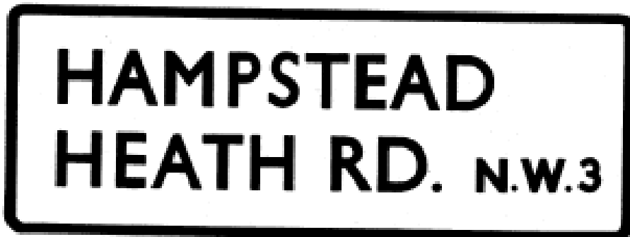
FIG. II KINDERSLEY - 90