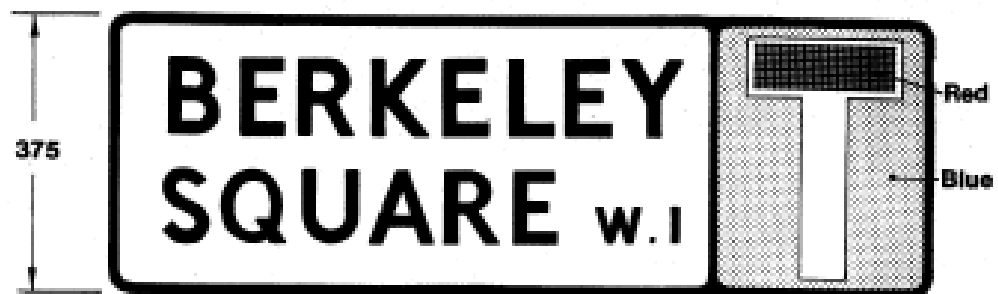
FIG. V PRE-1965 REVISED STANDARD ( \frac{1}{8} ) - 100 & 50