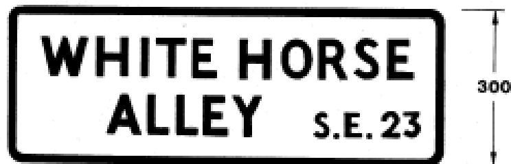
FIG. VI PRE-1965 REVISED STANDARD ( \frac{1}{8} ) - 75 & 50